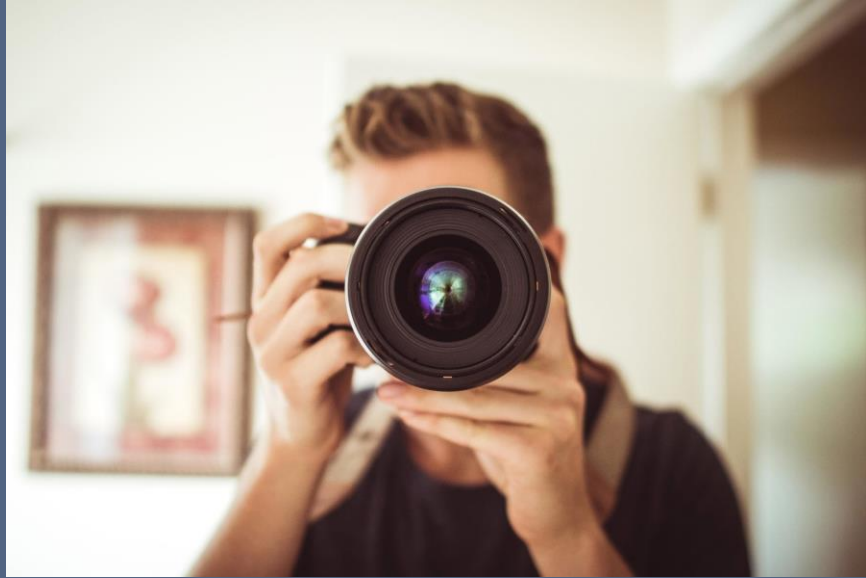
Photo Booth Set-Up for Church Directory

When: Sunday February 9th, 16th and 23rd and March 2nd